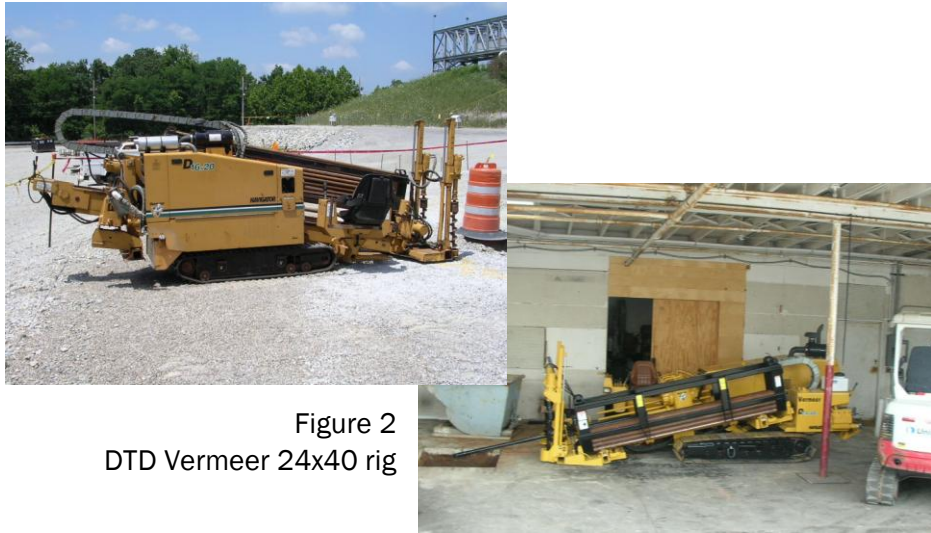
Figure 2 DTD Vermeer 24x40 rig

We have worked with manufacturers to improve rig performance in environmental work, and to improve the specialized drilling, reaming, and navigation tools we use in the field.