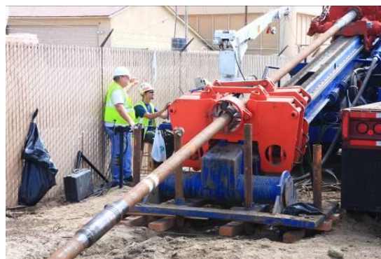
Figure 1 DTD American Augers D210

Horizontal directional drill rigs used by DTD advance a boring through the soil using a combination of thrust (equivalent to "downpressure" on a vertical rig) and cutting at the face of the drill head, using small high pressure jets of drilling fluid or mechanical cutting heads. The fluid jets cut the soil and then very quickly lose their cutting power. As a result, excessive soil erosion and overcutting do not occur using either cutting method. This process has been proven