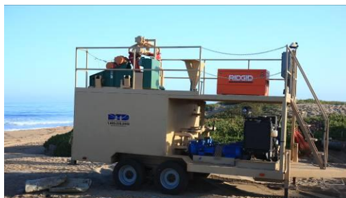
Figure 3 - DTD Mud Recycler

In addition to our drill rigs, DTD owns mud mixing and recycling systems that are matched to drill rig capacities, as well as a wide array of pumps, hoses and piping, and ancillary support equipment. We also own self-contained, totally enclosed trailer for equipment and tool transport. These trailers improve site security and prevent equipment theft and vandalism, as well as providing a discreet appearance at sensitive environmental remediation sites.